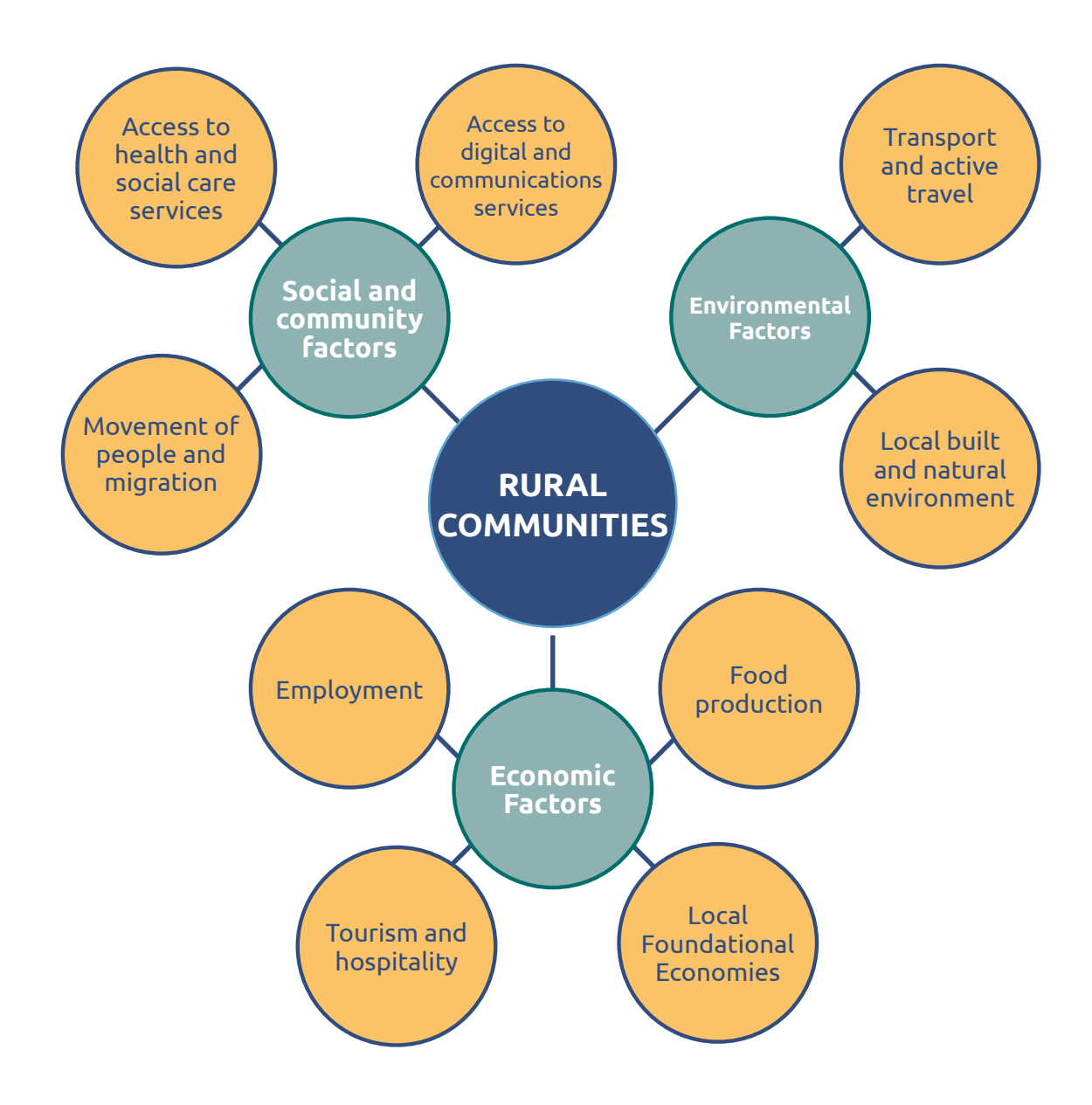
Figure 1: Summary of key determinants and pathways

This section provides an understanding of the individual and cumulative direct health and well-being impacts and the groups potentially affected.