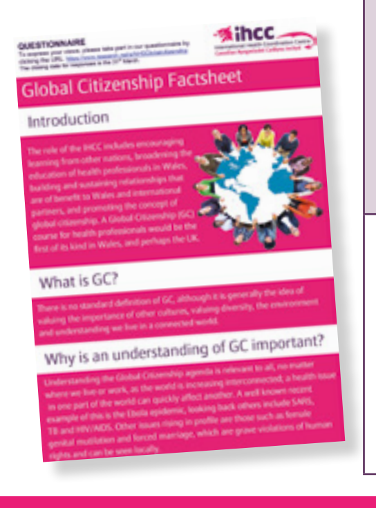
Figure 3. Global Citizenship Factsheet circulated to staff

Welsh health workers need to be encouraged and supported to develop appropriate roles that provide personal, organisational and wider benefits to Wales and its international partners.