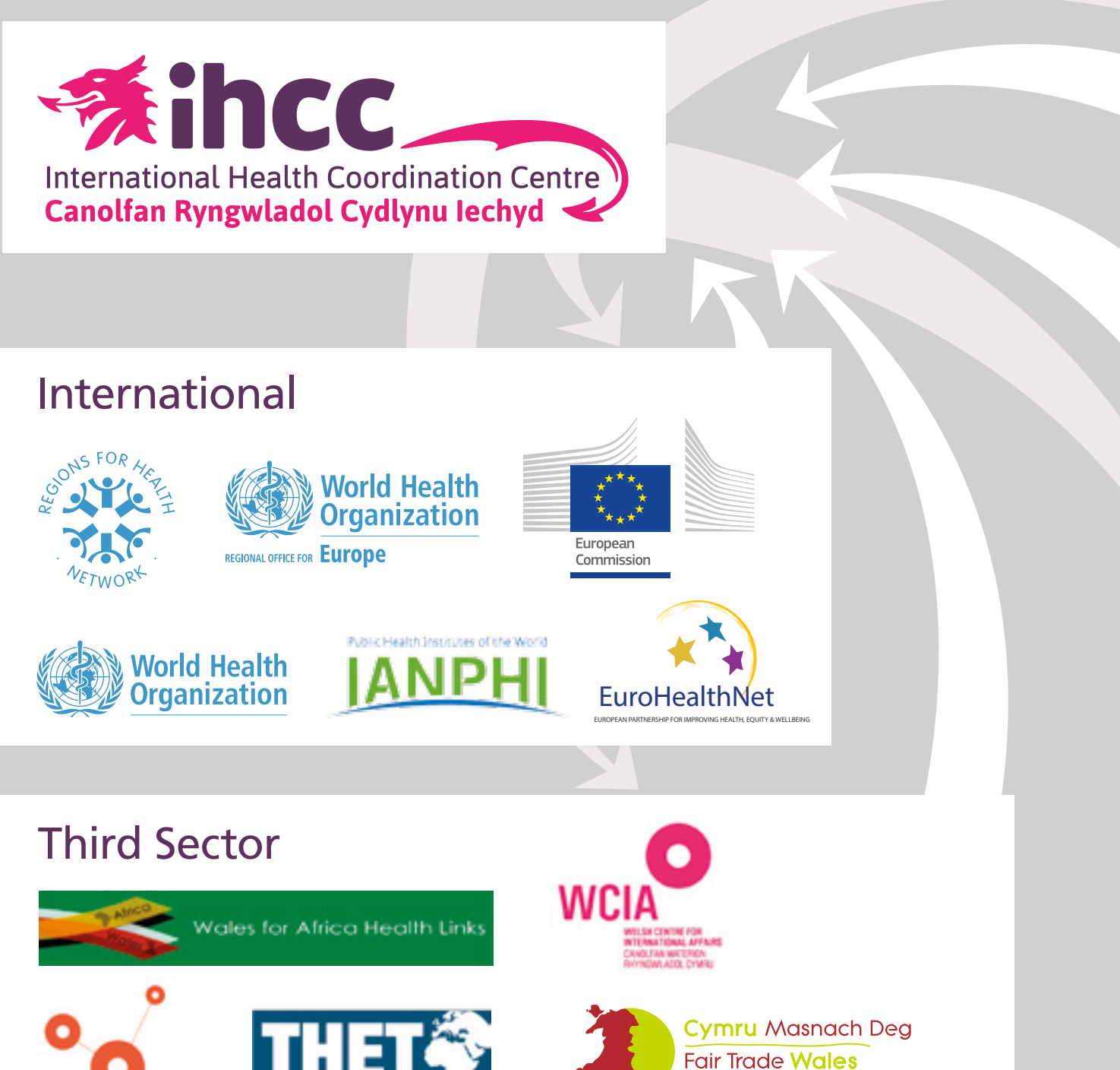
Figure 2. IHCC Stakeholder Map